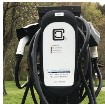
Where in Venango Co?