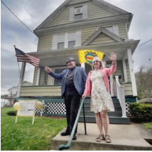
Love Notes Series