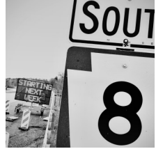
In Case You Missed It