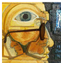
June Artist of the Month