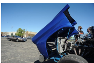
Modified Cranberry Festival Held